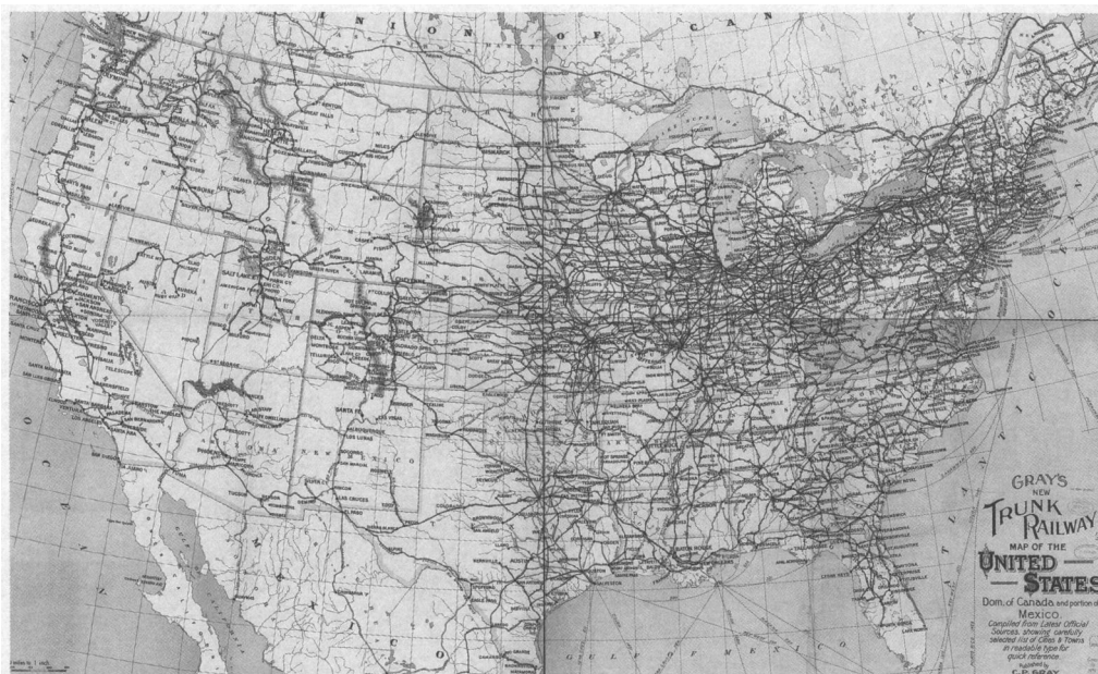
FIGURE 2 Gray's map of 1898 railroads

The a priori case for thinking that 1898 railroad kilometres satisfy exogeneity condition (17) rests on the length of time since these railroads were built and the fundamental changes in the nature of the economy in the intervening years. The rail network was built, for the most part, during and immediately after the civil war, and during the industrial revolution. At the peak of railroad construction, around 1890, the U.S. population was 55 million, with 9 million employed in agriculture or nearly 16% of the population (United States Bureau of Statistics, 1899, p. 3, 10). By 1980, the population of the U.S. was about 220 million with only about 3.5 million or 1.6% employed in agriculture (United States Bureau of the Census, 1981, p. 7, 406). Thus, while the country was building the 1898 railroad network, the economy was much smaller and more agricultural than it was in 1980 and was in the midst of a technological revolution and a civil war, both long completed by 1980.