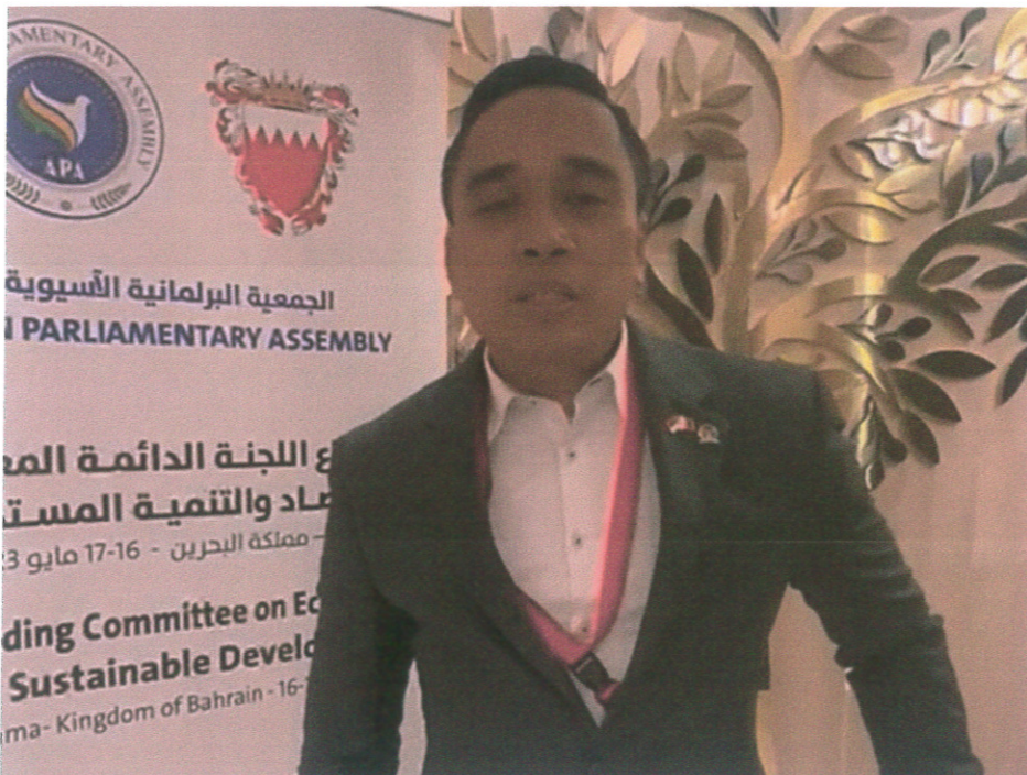
DOK. DPR RI Wakil Ketua Putu Supadma Rudana dari Fraksi Partai Demokrat

DELEGASI Badan Kerja Sama Antar-Parlemen Dewan Perwakilan Rakyat (BKSAP DPR RI) yang dipimpin oleh Wakil Ketua Putu Supadma Rudana dari Fraksi Partai Demokrat mengikuti Sidang Komisi Ekonomi dan Pembangunan Berkelanjutan Majelis Parlemen Asia ( Asian Parliamentary Assembly/APA ) di Manama Bahrain pada 14-19 Mei 2023.