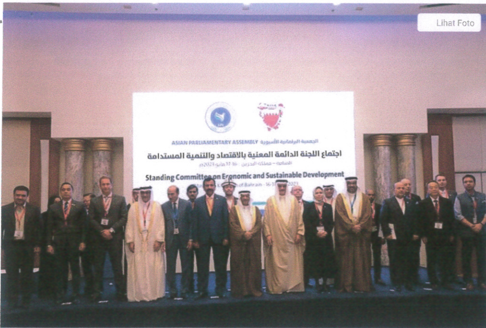
Sidang Asian Parliamentary Assembly (APA) Standing Committee on Economic and Sustainable Development berlangsung di Manama, Bahrain, mulai Selasa (16/5/2023) hingga Rabu (17/5/2023).