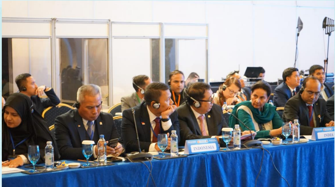
Ketua BKSAP Dr. Fadli Zon (F.P-Gerindra/A-86) bersama Wakil Ketua BKSAP Dr. Mardani Ali Sera (F-PKS/A-422) dan Achmad Hafisz Tohir (F-PAN/A-487) dalam Sidang Komite Anggaran

negara sehingga tidak lagi didasarkan pada jumlah penduduk maupun besaran ekonomi.