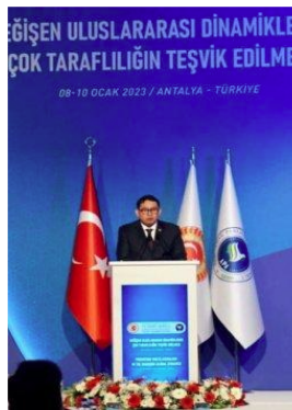
Ketua BKSAP Fadli Zon, menghadiri Sidang Parlemen Asia atau Asian Parliamentary Assembly (APA) yang ke-13 di Antalya, Turkiye, pada 8-10 Januari 2023.

Rabu, 11 Januari 2023 06:31 WIB Penulis: Larasati Dyah Utami Editor: Theresia Felisiani