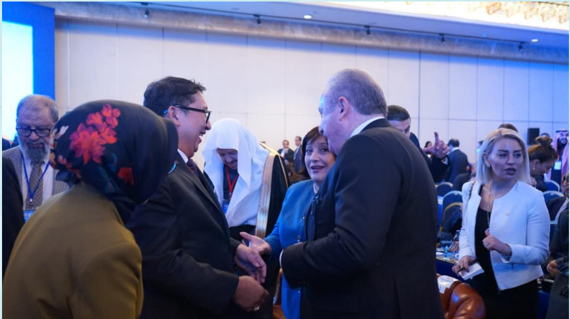
Ketua BKSAP Dr. Fadli Zon (F.P.-Gerindra/A-86) sebagai Ketua Delegasi DPR RI menyapa Ketua Delegasi negara-negara anggota APA setelah Inaugural Ceremony