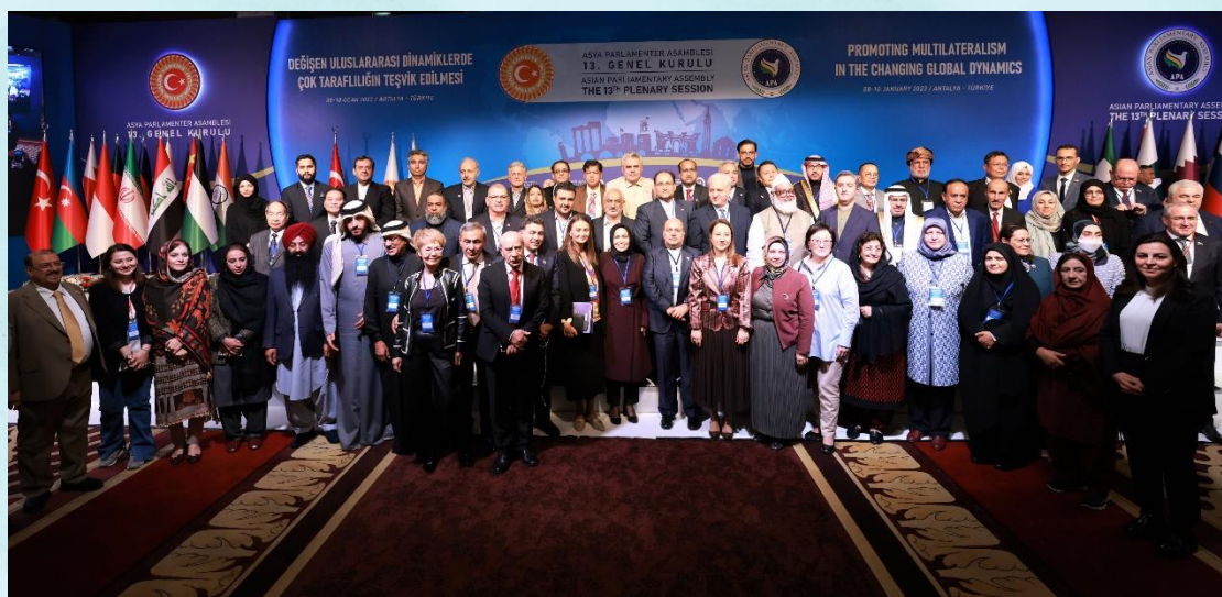
Seluruh Delegasi APA berfoto bersama setelah Closing Session

Palestine, Iran, dan Yaman yang merasa tidak puas dengan kesepakatan-kesepakatan yang dibacakan oleh rapporteur .