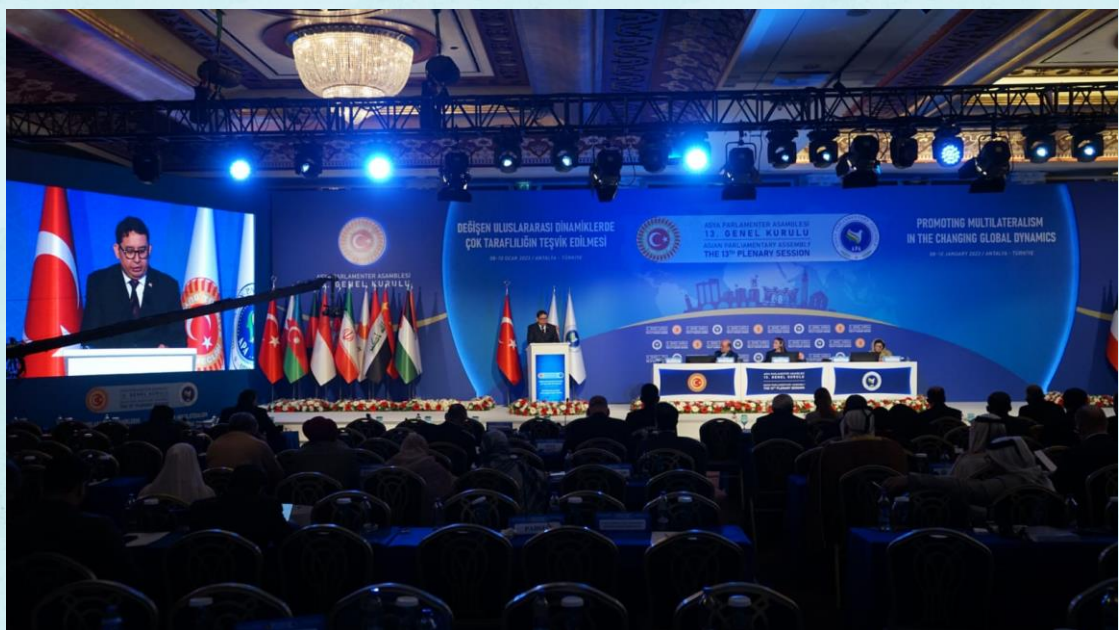
Ketua BKSAP Dr. Fadli Zon (F.P-Gerindra/A-86) menyampaikan pandangan Delegasi DPR RI pada Plenary Session

Pertama , negara-negara Asia memiliki potensi yang sangat besar untuk menjadi pusat ekonomi dan masa depan dunia karena memiliki pertumbuhan ekonomi yang massif, ditopang oleh bonus demografi, kemajuan teknologi yang pesat, kekayaan sosial budaya yang beragam serta modal ekonomi dan sosial yang sangat besar.