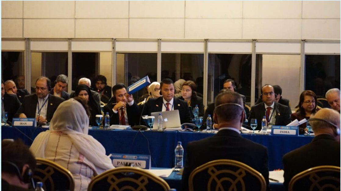
Wakil Ketua BKSAP Dr. Mardani Ali Sera (F-PKS/A-422) bersiap memberikan intervensi pada Sidang Komite Politik

Terkait Draft Resolution on Good` Governance , Mardani Ali Sera menyampaikan bahwa perbaikan tatakelola pemerintahan/ good governance harus tanggap dan responsif terhadap kejadian pandemi dan pemulihan pasca-pandemi. Menurutnya, pandemi Covid-19 telah memberikan tantangan terhadap efektivitas tata pemerintahan yang baik terutama dalam hal transparansi, partisipasi publik, supremasi hukum, dan inklusivitas. Oleh karena itu, anggota parlemen memikul tanggung jawab untuk mengembalikan semua prinsip tata pemerintahan yang baik itu ke dalam praktik pemerintahan sehari-hari.