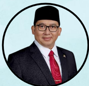
Dr. Fadli Zon, SS, M.Sc. F-P.Gerindra/A-86 Ketua BKSAP / Anggota Delegasi

Susunan Delegasi DPR RI pada Sidang Pleno ke-13 Asian Parliamentary Assembly (APA) pada tanggal 8-10 Januari 2023 di Antalya, Turki terdiri dari: